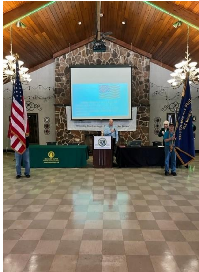
Pledge and Color Guard – Thanks to the American Legion!